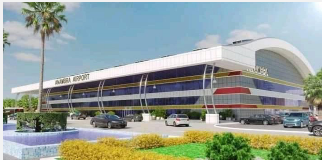
Anambra State International Airport

Marriott International, Inc. is a multinational company that operates, franchises, and licenses for lodging including hotel and residential properties. With its Headquarters in Bethesda, Maryland, Marriott is the largest hotel chain in the world by the number of available rooms.